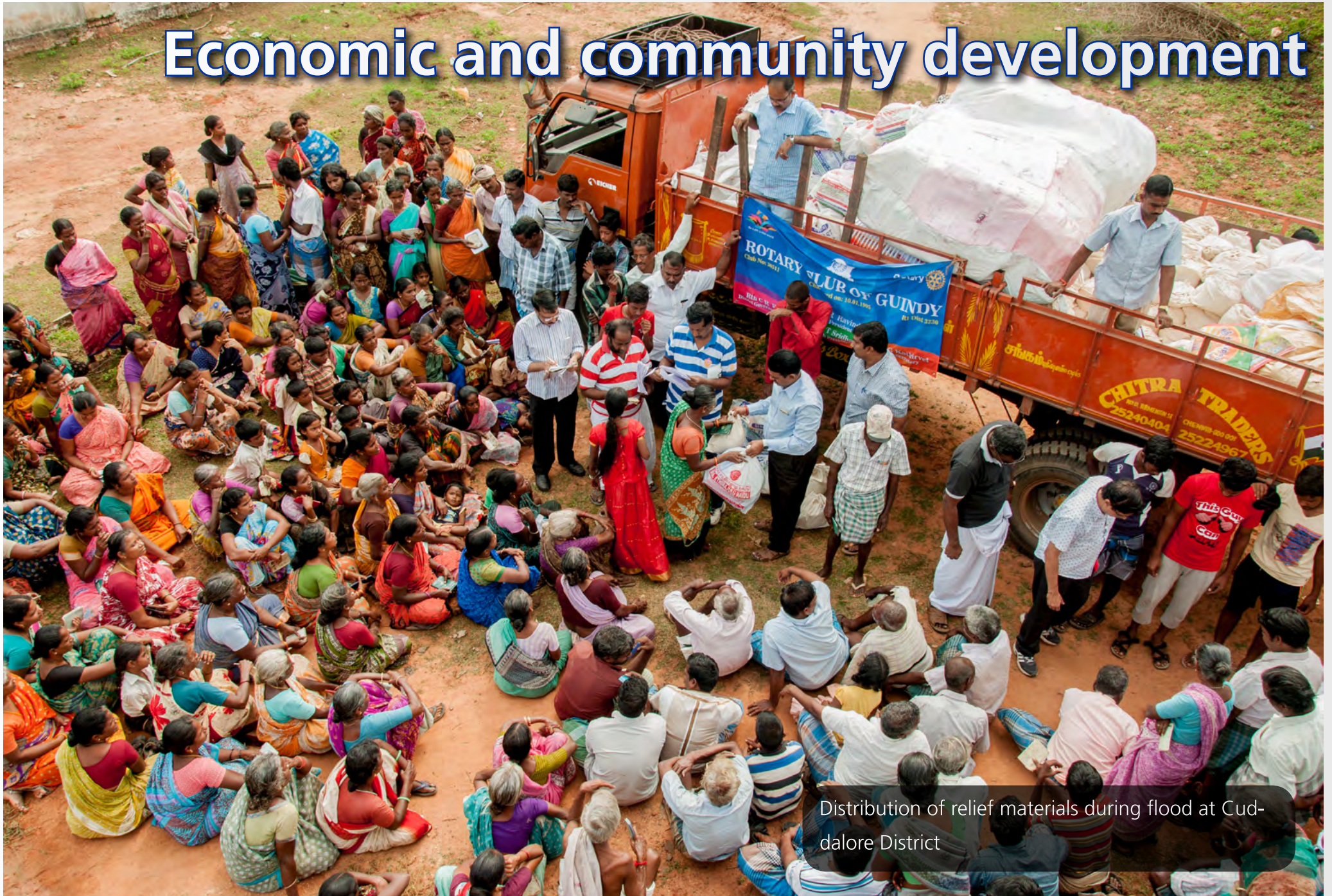
Distribution of relief materials during flood at Cuddalore District